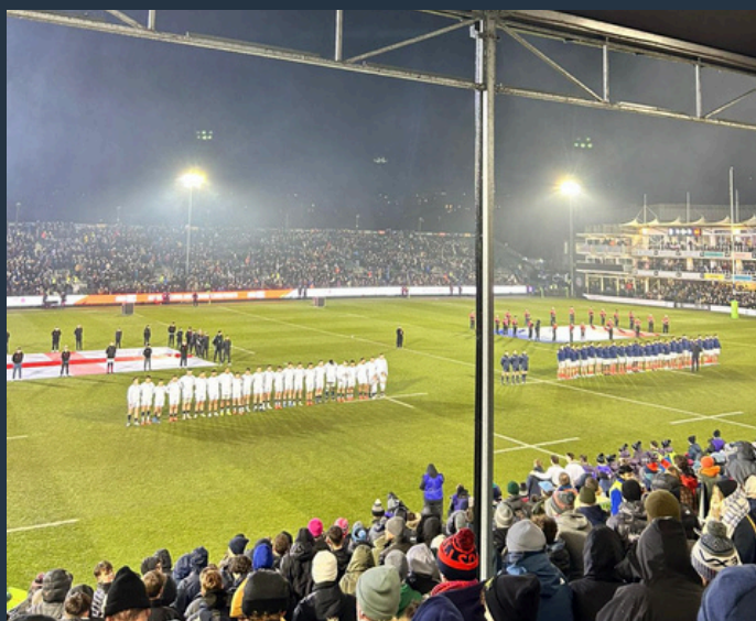
U20 England Rugby Match trip last week!